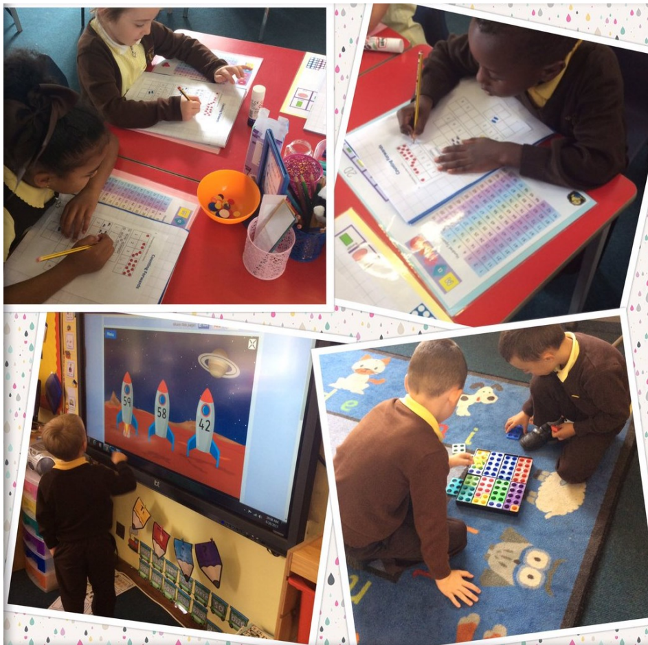
Great independent work in Year 1 maths lessons this week.