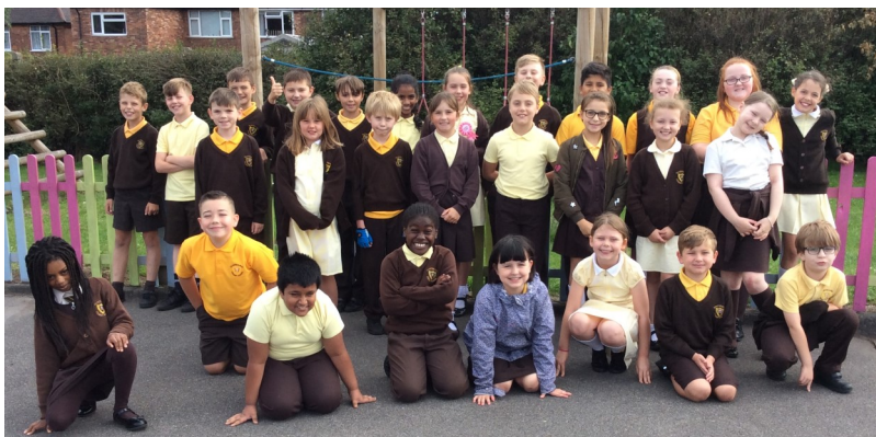
... our Year 5 Children