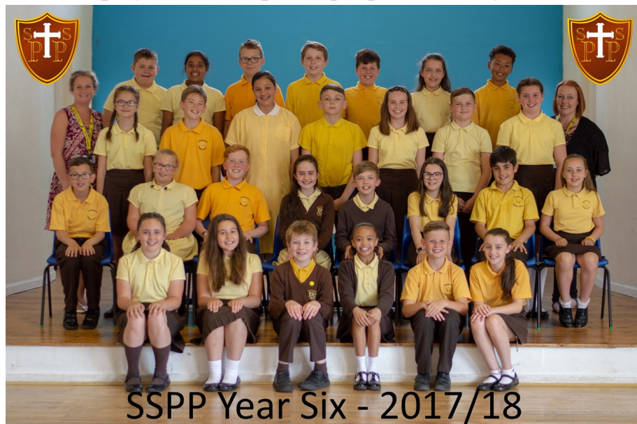
SSPP Year Six - 2017/18

This week we pray for these special people! Goodbye & Good Luck!