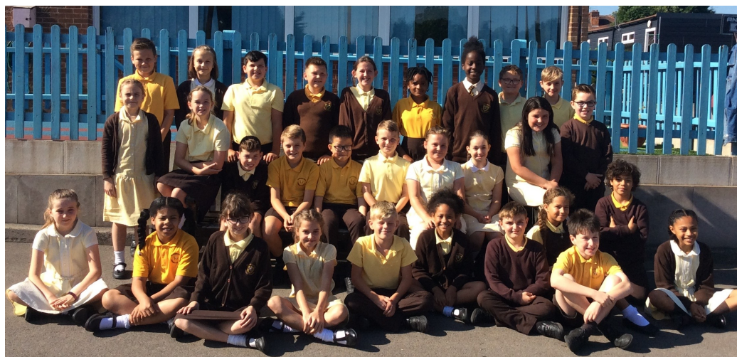
Year 6 Class

This week we pray for these special people!