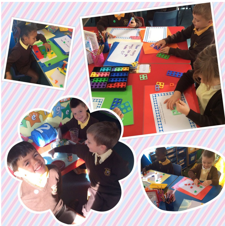
Working together to solve problems in Year 1 this week.