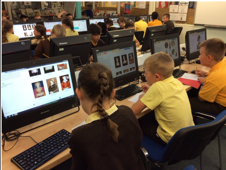
Year 5 researching information on the Tudors at the start of their new topic. Well done Year 5.