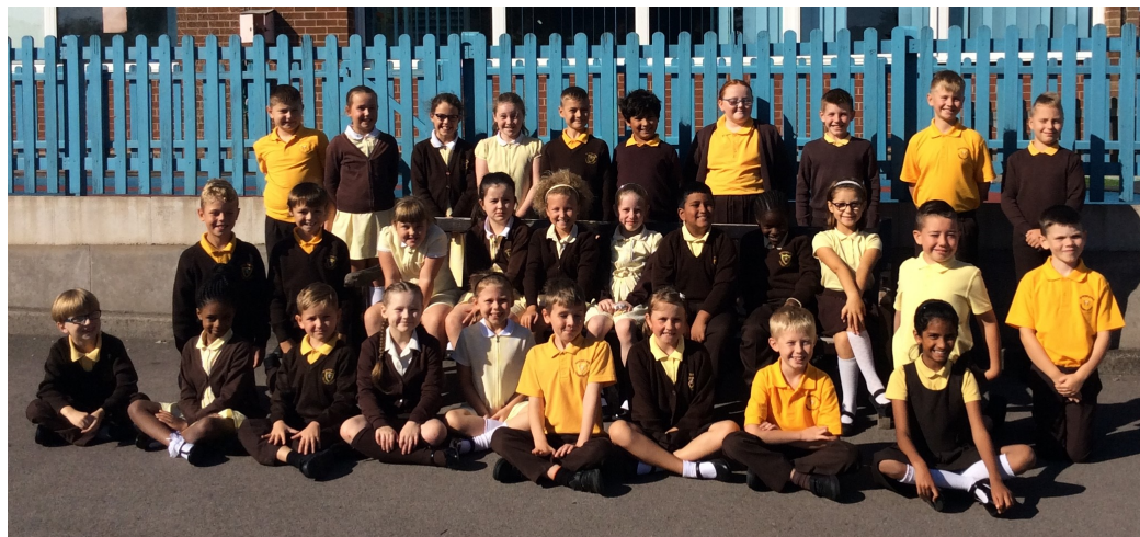
Year 4 Class

This week we pray for these special people!