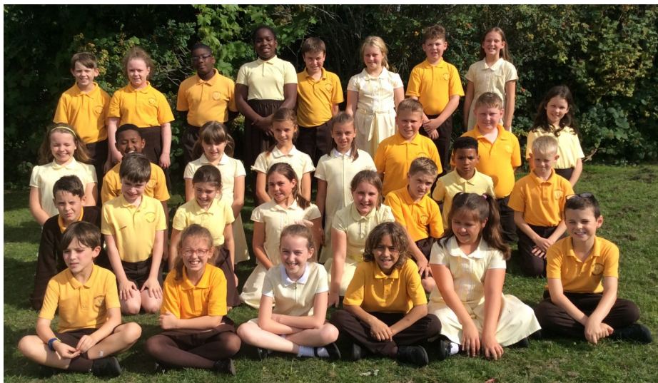
Year 5 Class

This week we pray for these special people!