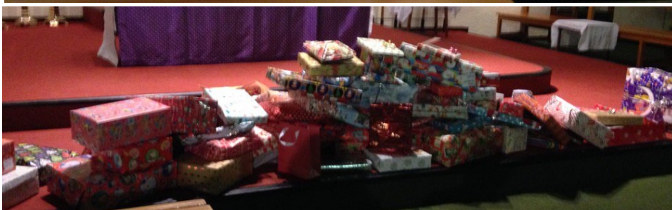
Gifts donated to the NSPCC. Such generosity... thank you parents.