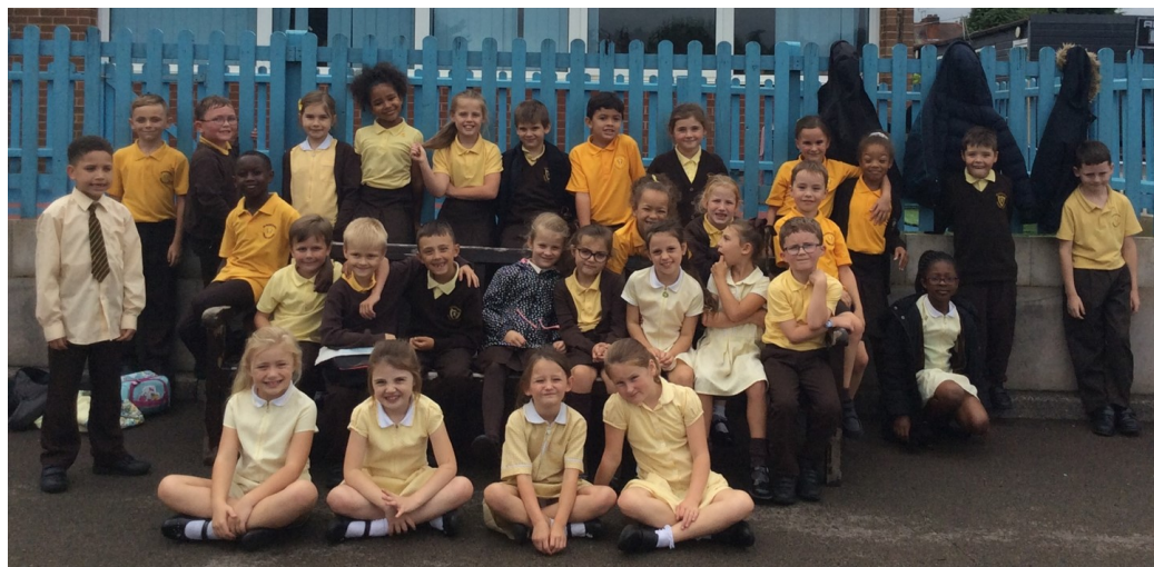
Year 3 Class

This week we pray for these special people!