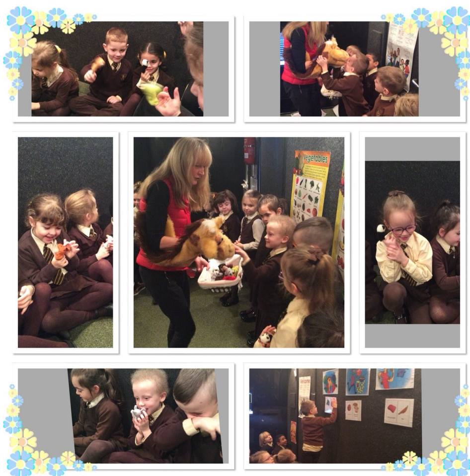
Year 1 met Harold the Giraffe as part of their learning this week.