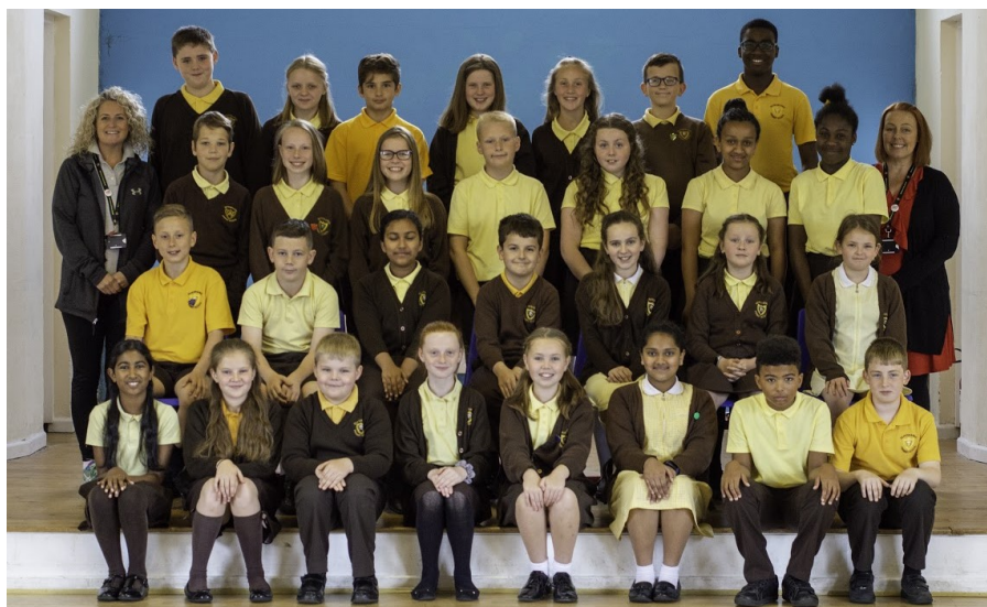
Goodbye & Good Luck... Year 6

This week we pray for these special people!