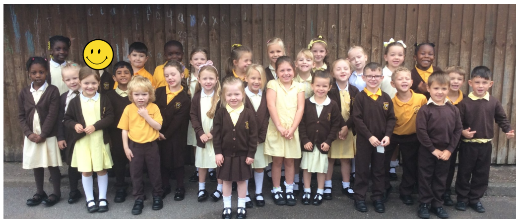
Year 1 Class

This week we pray for these special people!